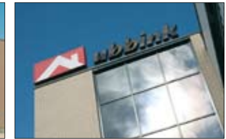
Ubbink B.V. (NL)