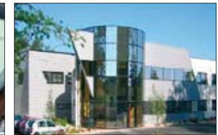
Ubbink France (F)