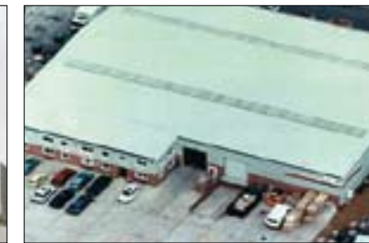
Ubbink UK Ltd.