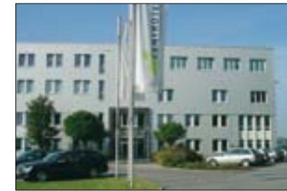
Centrotherm Systemtechnik GmbH (D)