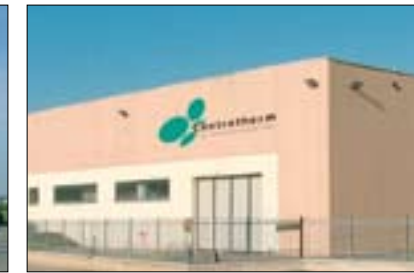
Centrotherm Gas Flue technologies (I)